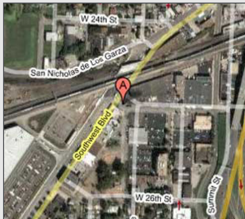
Map to Social Event