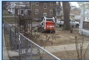
Omaha Lead Site Residential environmental cleanup