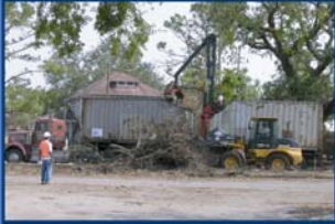
New Orleans Emergency Response Katrina Cleanup Debris removal, demolition