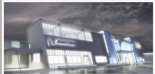
Boeing Delivery Center - Everett, WA