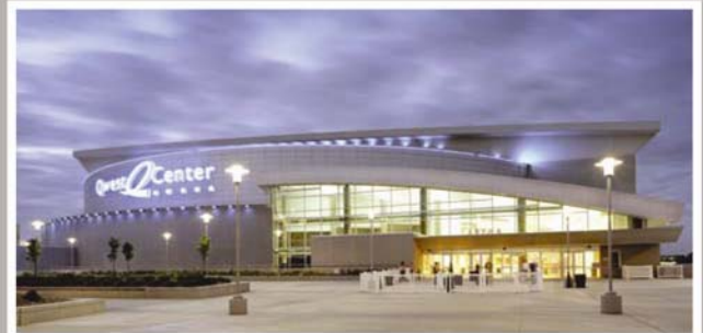
Qwest Center - Omaha, NE