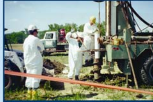
Iowa Army Ammunition Plant Cradle-to-grave environmental remediation, construction, UXO