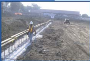
Offut AFB Construction